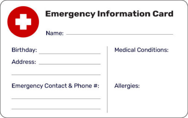
Wallet-Sized Emergency Information Card