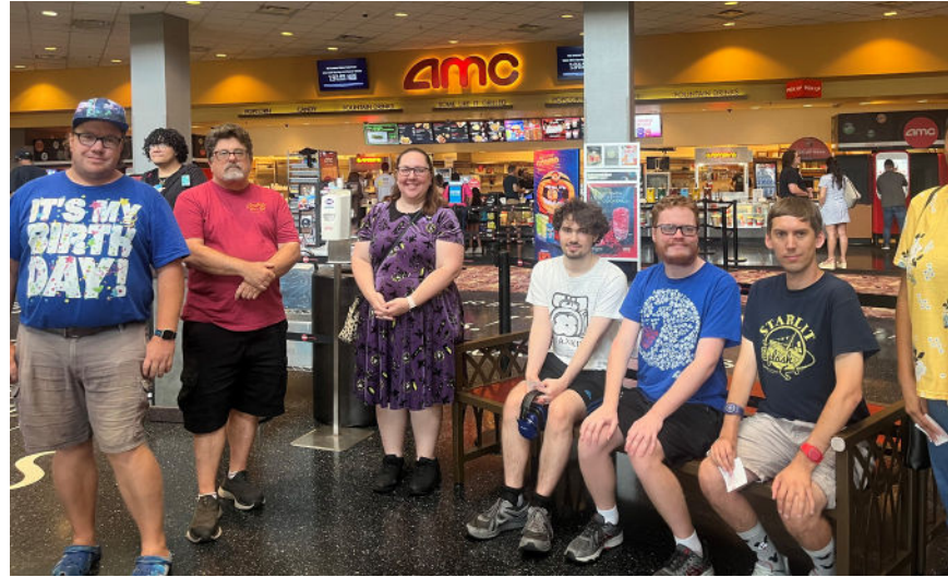
University of Central Florida Foundation received a grant from NEXT in 2023 to support housing for autistic adults.

All grantees agree to comply with robust accountability measures via year-end reporting.