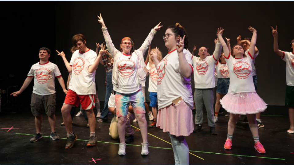
ActionPlay provides autistic, neurodivergent, and disabled teens and adults with equal access to the theatre-making process.

When the programs that NEXT funds are successful, we are all successful. Part of their success includes the NEXT team performing regular check-ins with the organizations, to ensure they are on track to meet the goals of their grant. And if they're not, how can we help?