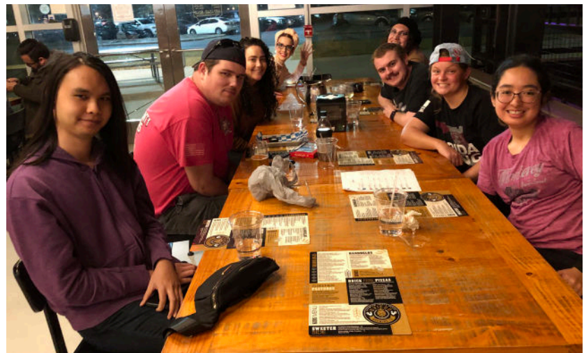
(Left) SARRC residents.