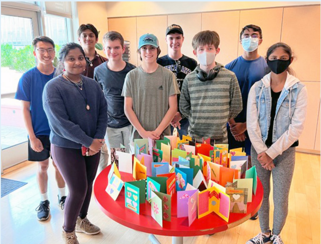
Southwest Autism Research & Resource Center (SARRC), a NEXT for AUTISM grant recipient in 2023. SARRC builds inclusive communities for individuals with autism and their families.

Following the rhythm of NOTMS, NEXT has historically invited organizations to apply for funding during alternate years. In 2025, NEXT is transitioning to an annual cycle to help expedite grant funding to these innovative organizations.