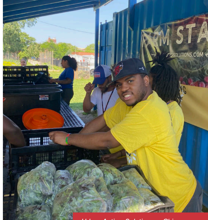
Urban Autism Solutions, a Chicago-based NEXT for AUTISM grantee

NEXT follows a rigorous review process to identify and award grants, thanks in part to a review committee comprised of neurodivergent and neurotypical professionals.